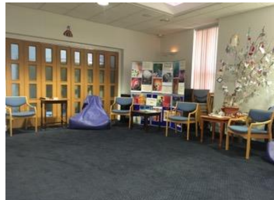
The Chapel-Wigan Royal Albert Edward Infirmary.