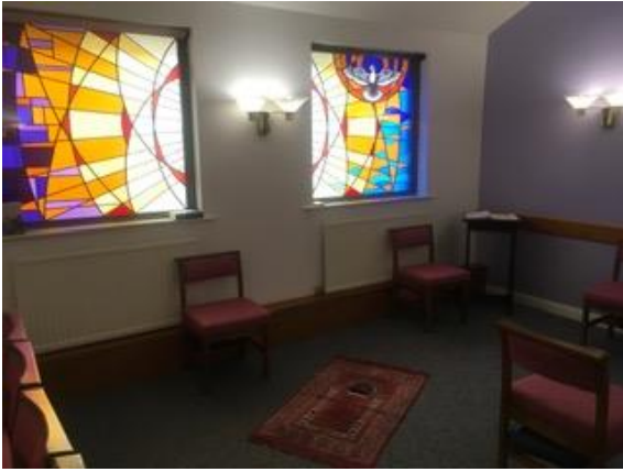
Multi-Faith Prayer Room at Leigh Infirmary.