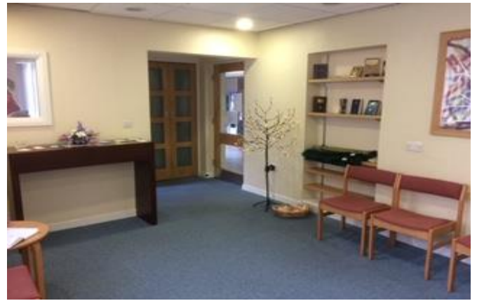
Multi-Faith Prayer Room at Wrightington Hospital.