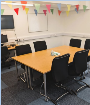
Large Meeting Room